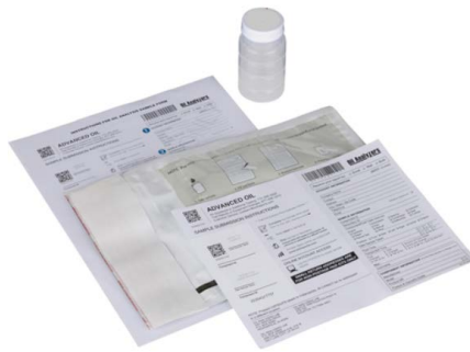
KIT02-EA, UPS Pre-Paid

3. Perform an oil analysis with each oil change. Kits can be purchased directly through Amsoil or you can check with your Amsoil Dealer if you have questions. I personally recommend KIT-02, UPS pre-paid. I also highly recommend putting the sample in a cardboard box (rather than the included mailer) and use the pre-paid label on the box. When the results arrive, if needed, your Amsoil Dealer can help you read the analysis.